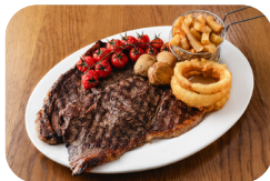
32oz Rump Steak