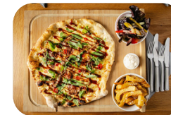
Pulled Pork & Chilli Flatbread