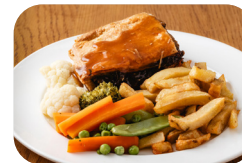
Homemade Steak & Ale Pie