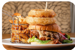
Go Dirty Cheese Burger