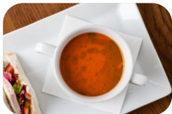
Soup of the Day