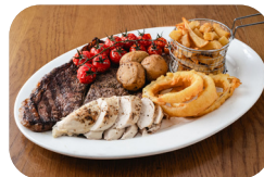
16oz Rump Steak & Chicken