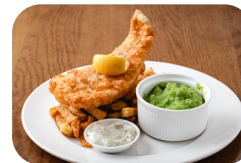
Hand Battered Cod